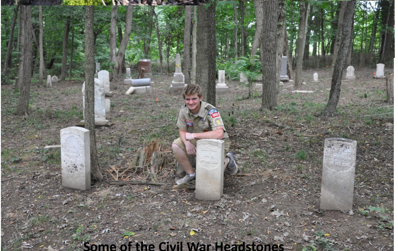
Some of the Civil War Headstones